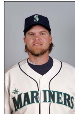
All-Star pitcher Felix Hernandez and sluggers Robinson Cano and Corey Hart .

Take some time and view the Tigers' Hall of Fame Statues of Hank Greenberg , Ty Cobb , Charlie Gehringer , Hal Newhouser , and Al Kaline , along with star leftfielder Willie Horton in the left field concourse and Hall of Fame announcer Ernie Harwell near the first base concourse. Note: Norman "Turkey" Stearnes' plaque is located outside the center field wall, at the corner of Adam & Brush Streets. Also see the Ferris Wheel and Tiger Carousel near third base and home plate respectively.