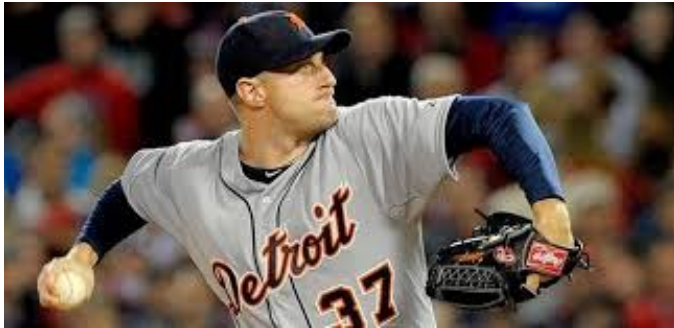
See current Cy Young winner Max Scherzer.

Join us Friday night at sold-out Comerica Park Tiger treats!