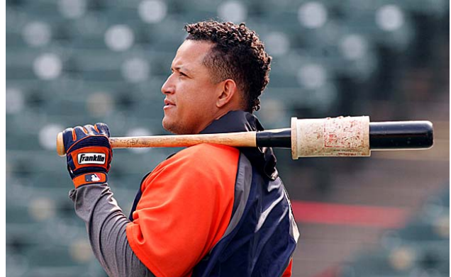
See current two-time AL's MVP Miguel Cabrera